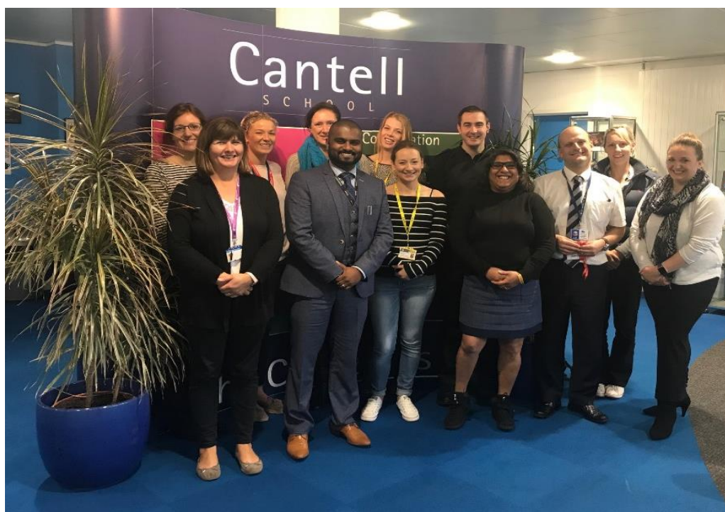
The Neglect Task & Finish Group

The Task & Finish Group appointed to work together to produce a multi-agency strategy and new 'toolkit' or guide to responding to neglect for Southampton comprised a range of professionals and dedicated to dealing with the issue. I strongly believe that neglect is a precursor to other issues that are very much in the public eye at the moment; child sexual exploitation, criminal exploitation and mental health difficulties into adulthood. If we can respond early our young people will be so much more able to thrive and live positive lives. This I feel is the key to tackling neglect.